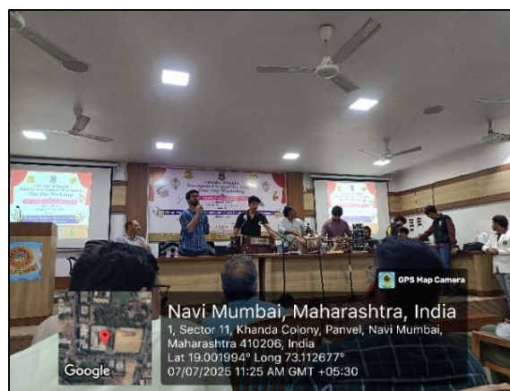
Live musical and instrumental demonstration.