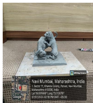
Demonstration of collage, rangoli and clay model by winner's of youth festival.