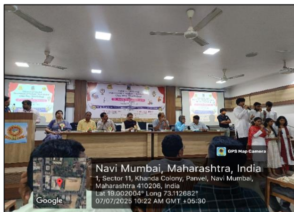
Inaugural ceremony of the workshop.